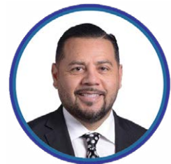
Luis Cruz Building Your Guiding Coalition (Video resource to be made available to all teams)

* Recommended team composition: 4-12 teacher leaders and building/district administrators working side by side to improve academic outcomes for all students.